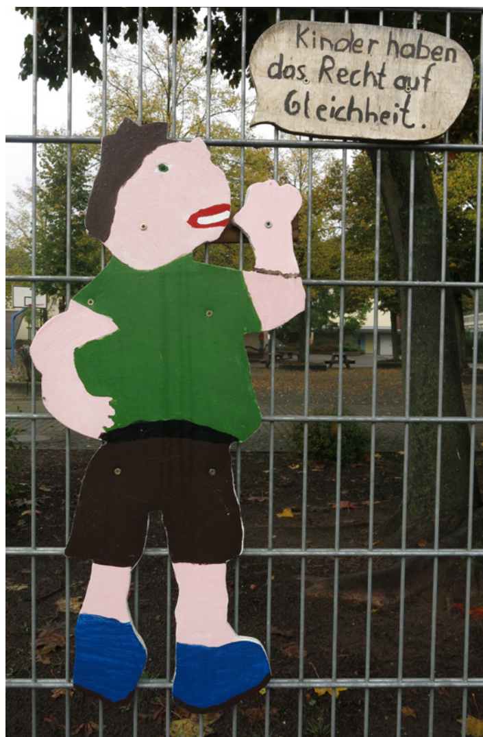
'Children have the right to equality', Albert-Schweitzer-Schule, Germany

Respondents were largely sceptical about the barriers to implementing human rights education, including lack of support for the CRC and a more general traditional of American 'exceptionalism'.